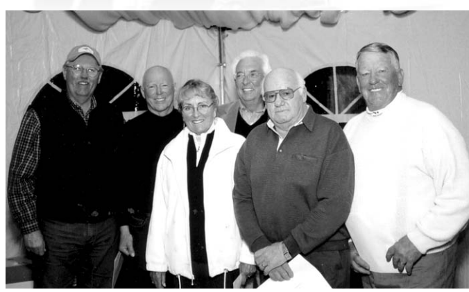
40-year pin recipients are honored during the Spring Clinic banquet.

Spring Clinic 2005