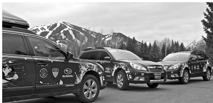
Subarus from various divisions sit parked at the base of Sun Valley during Spring Clinic. PSIA/AASI members receive a new Subaru discount.